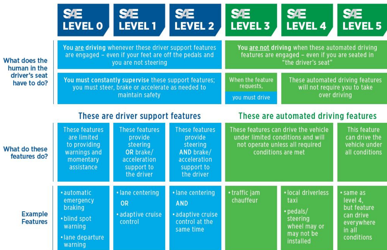
FIGURE 1: SAE J3016 LEVELS OF DRIVING AUTOMATION

automation. SAE International has produced the graphic in Figure 1 to aid policymakers and the public in understanding technology capabilities and driver responsibilities at various levels of automation: